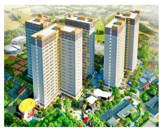
Figure 1. Menara Cibinong Apartment