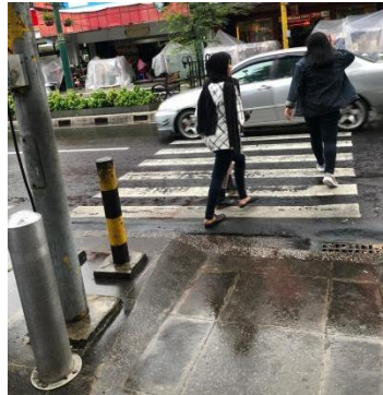
Figure 7. Zebra cross

Three components are used in the zebra cross accessibility requirements, it get 6 points. In Malioboro area, zebra crossings are available at several points to provide safety for pedestrians. A button to cross that is equipped with sound and visual is already available in the area, so that people with disabilities can move independently. At the end of the crossing area, both on the east and west sides, there are ramps.