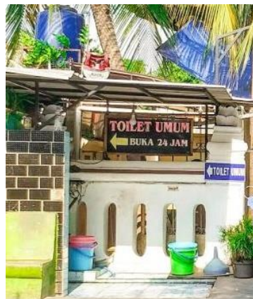
Figure 11. Toilet