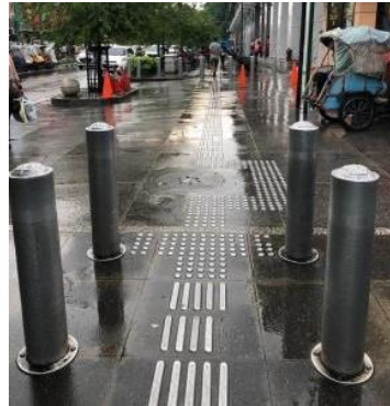
Figure 4. Guiding lane