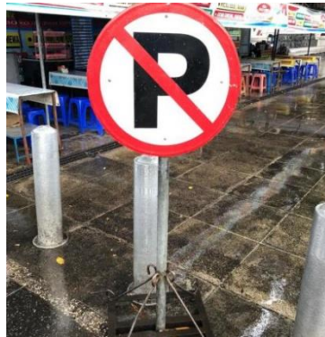
Figure 9. Sign and marking

Three components are used in terms of accessibility of signs and markings, with 4 points of scoring. There are no signs and markings in braille that are specifically for the disabled. The signs available at these locations in the form of prohibition signs, command signs, and general guidance signs in locations that are free of sight without any barriers and have used international symbols, so that they are easily understood by local and foreign tourists when visiting. However, there are some signs that are starting to fade, making it difficult to read in long distances.