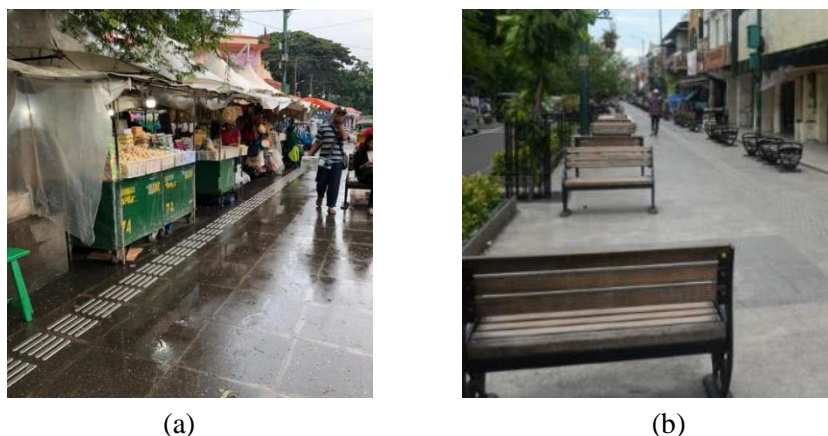
Figure 3. Pedestrian way, east side (a), west side (b)

The score of west side pedestrian way is 10 points, with a smaller width than the east side, which is 9 m, but visitors can move freely. The surface of the pedestrian way is quite stable, strong, not bumpy and not slippery at all locations. In addition, the placement of street furniture does not interfere with the comfort and safety of people with disabilities, and street vendors have used the places provided by the government to sell. The availability of seats is very adequate, with a distance of every 200 cm visitors can find seating facilities.