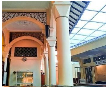
Figure 10. Worship place

Four components are used in terms of accessibility of places of worship, it gets 8 points. The availability of places of worship in this area is quite good and the location is strategic. Places of worship for men and women are separate, equipped with adequate worship facilities. The condition of the ablution place both in terms of lighting and floor texture is quite good, namely lighting from sunlight during the day and lighting at night and the floor texture is not slippery, so it does not interfere with worship activities.