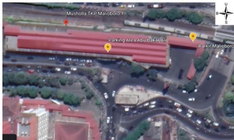
Figure 2. Abu Bakar Ali's special parking areas