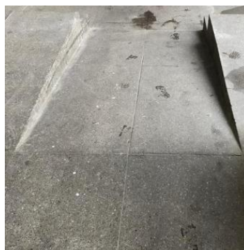
Figure 6. Ramp condition

Four components are used in the accessibility requirements of the ramp and the score is 7. The condition of the ramp has a slope of 7^\circ and a ramp width of 100 cm without a safety edge, the condition of the ramp surface is not slippery, stable, strong and textured, but the condition of the end of the ramp is quite sharp which has the potential to be dangerous visitors. The ramp is equipped with the availability of sufficient lighting at every point.