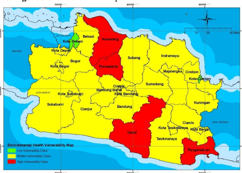
Figure 5 Environmental Health Vulnerability Map of West Java Province

EHV is obtained from scoring the indicators of access of water sources and access of sanitation in West Java Province. Figure 5 shows the EHP map.