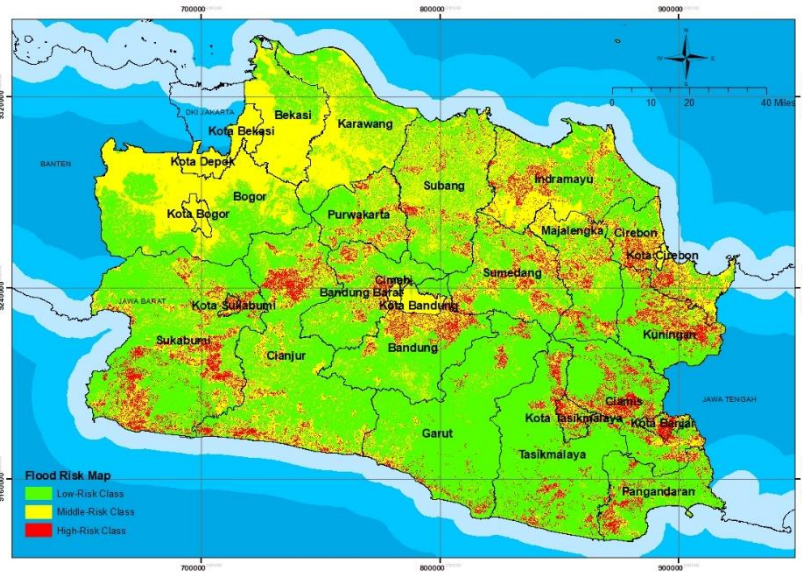
Figure 4 Flood Risk Map of West Java Province

From the total area of West Java Province, 56.57% (20,978,912,805 ha), 33.85% (12,552,676,083 ha), and 9.58% (3,553,895,565 ha) has a low, medium, and high flood risks, respectively. Sukabumi Regency has the largest high-risk areas (569,985,789 ha or 1.54% of West Java Province).