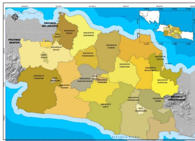
Figure 3 West Java Province (Regional Development Planning Agency of West Java, 2019)

With its geological, volcanic, climatic, and environmental condition, West Java is one of the most disaster-prone areas in Indonesia. Historical data on the occurrence of disasters shows that floods are the most frequent (32.83%) of total disasters in West Java. Floods are also forecasted to be the number one cause of future potential disasters in West Java [29]. The northern and central parts of West Java have been identified as the most flood-prone region, which are vulnerable to future disasters.