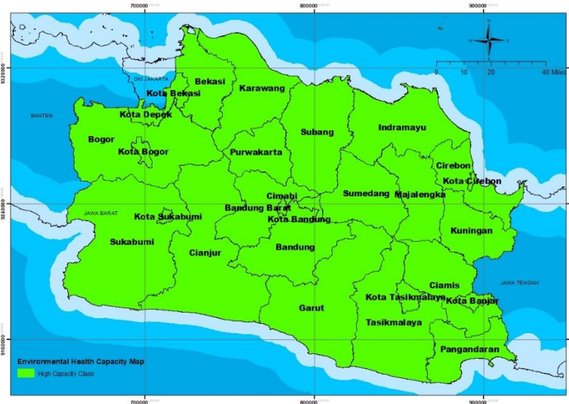
Figure 6 Environmental Health Capacity Map of West Java Province

The map of environmental health capacity is obtained from document review based on the government's ability to provide access to health facilities/services, health workers, health education, and emergency preparedness or response. A map of environmental health capacity can be seen in Figure 6 shows environmental health capacity map of West Java Province.