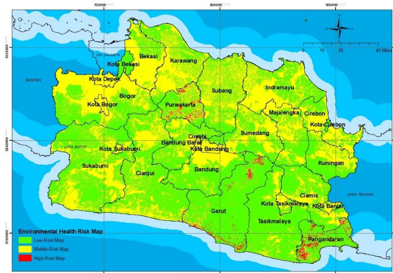
Figure 7 Environmental Health Risk Map of West Java Province

Based on the results of the overlay and calculations, the environmental health risk shown that from the total area of West Java Province, 57.24% (21,228,362,159 ha), 41.75% (15,484,436,486 ha), and 1% (372,685,808 ha) has a low, medium, and high environmental health risks, respectively. Pangandaran Regency has the largest high-risk areas (148,487,001 ha or 0.40% of West Java Province).